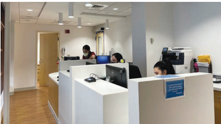
The Tomorrow Fund Clinic reception desk