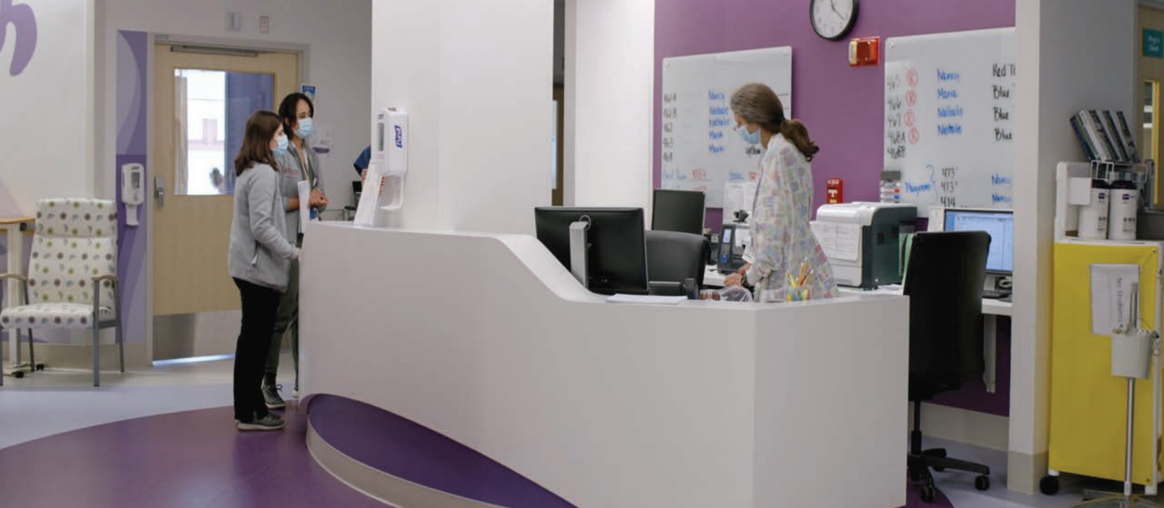
Hasbro 4 inpatient work station