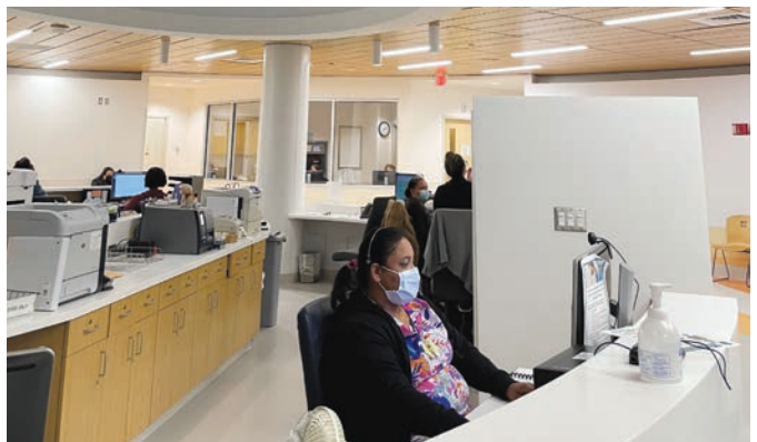
Ambulatory Clinic reception